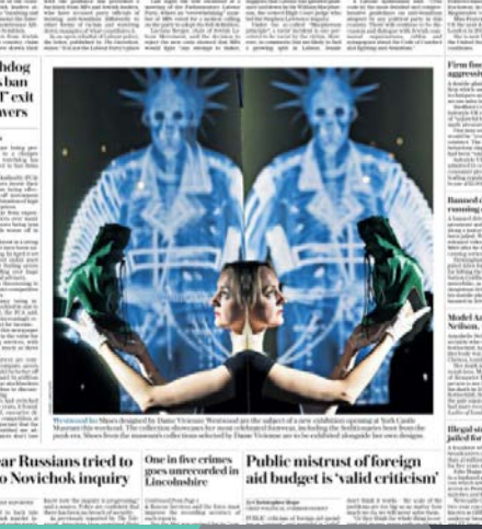
The Daily Telegraph