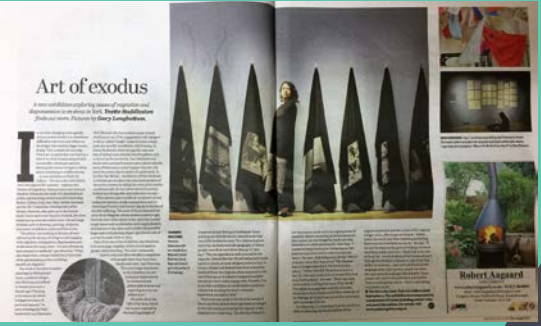
The Yorkshire Post