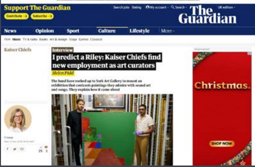
The Guardian website