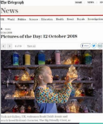
The Telegraph Online