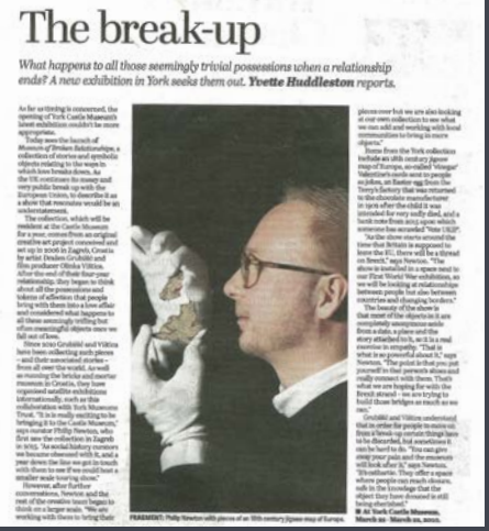
The Yorkshire Post