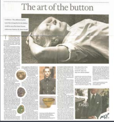
The Financial Times