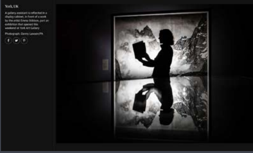
The Guardian website