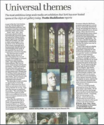
The Yorkshire Post