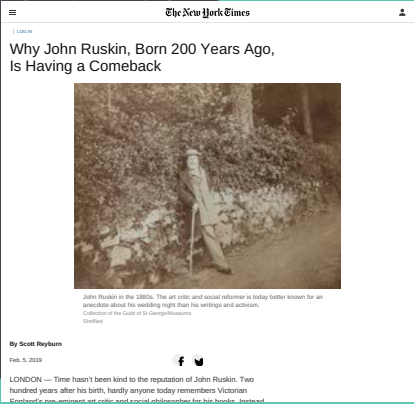
The New York Times