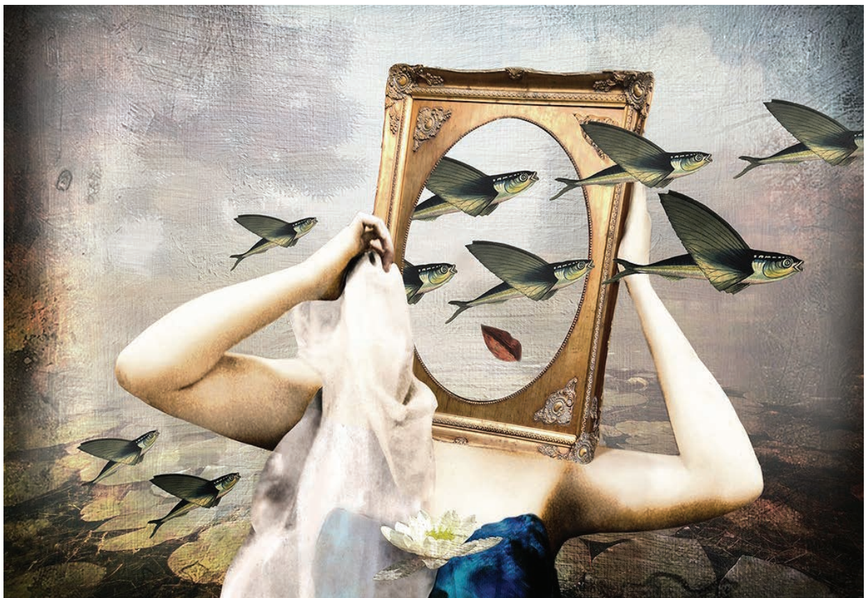
Frame of Mind, 2018 Collection © Adele Karmazyn