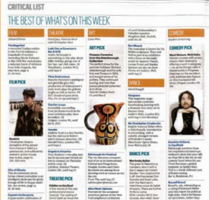
The Sunday Times