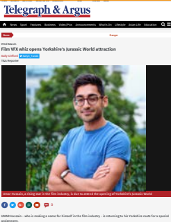
The Telegraph and Argus