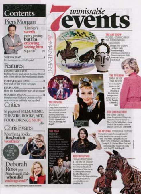
The Mail on Sunday