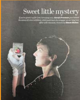
The Yorkshire Post Saturday Magazine cover