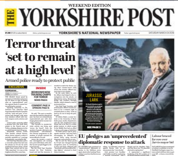
The Yorkshire Post front page