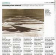
The Guide, Guardian