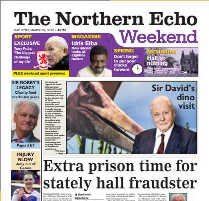
The Northern Echo front page