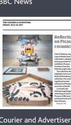
Courier and Advertiser