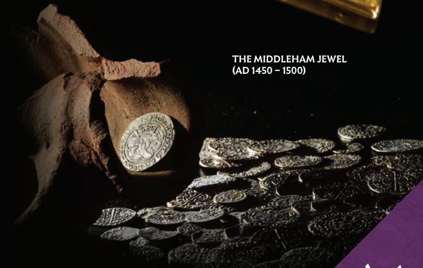
THE RYTHOR HOARD (AD 1485 - 1490)