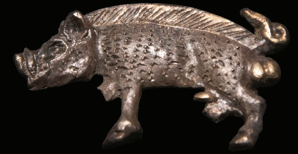
THE YORK BOAR BADGE (AD 1483 - 1485)