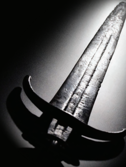
THE CAWOOD SWORD (AD 1080 - 1120)