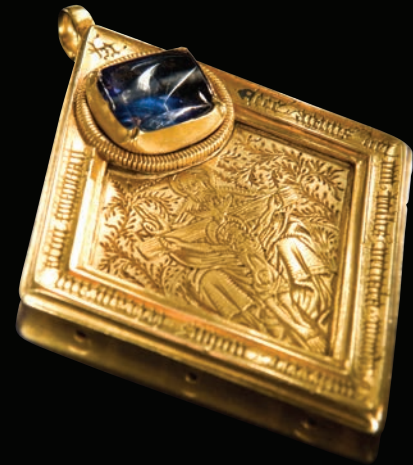
THE MIDDLEHAM JEWEL (AD 1450 - 1500)