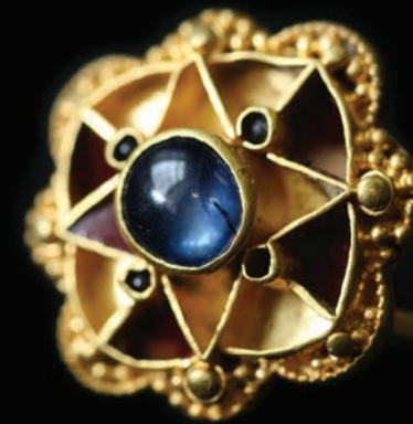
THE ESCRICK RING (AD 400 - 600)