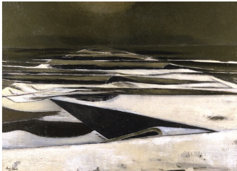
Paul Nash, Winter Sea, 1925-1937.