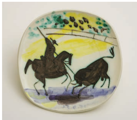
Pablo Picasso, Picador Charging a Bull , 1953.

Located in two stunning galleries framed by original architecture and flooded with natural light, CoCA showcases the most important ceramics in our collection, the artists who made them and the collectors who acquired them.