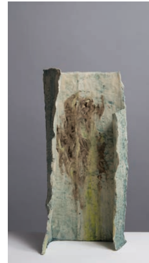
Sara Radstone, Mirror IV , 2010.