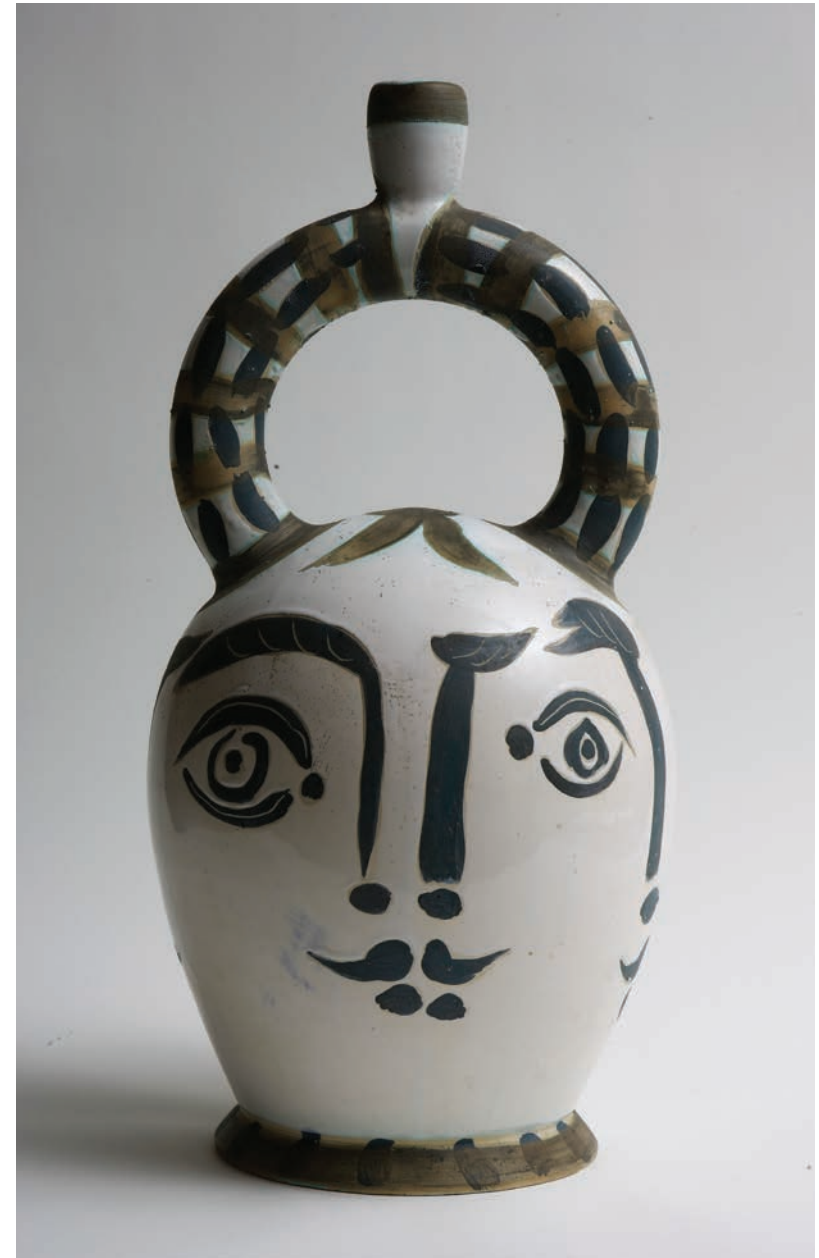
Pablo Picasso, Heads of Women , Aztec vase, 1957. Image by kind permission of the Estate of Lord and Lady Attenborough and The Leicester Arts and Museums Service. © Succession Picasso/DACS, London 2017.