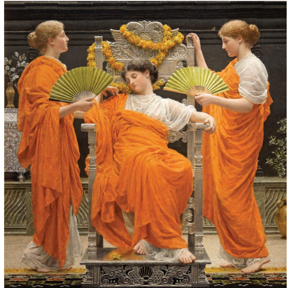
Albert Moore, Midsummer, 1887.

Organised by York Museums Trust and Museum De Buitenplaats, in Eelde, Holland, the exhibition features paintings from across Albert Moore's career, from his early religious painting of Elijah's Sacrifice (Bury Art Gallery) of 1863, to the stunning and ambitious Midsummer , 1887 (Russell-Cotes Art Gallery, Bournemouth) and his final painting, The Loves of the Winds and the Seasons (Blackburn Museum and Art Gallery), finished just a few days before his death. Paintings from York Art Gallery feature alongside major loans from public and private collections across the UK.