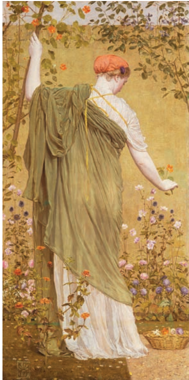
Albert Moore, A Garden , 1869.