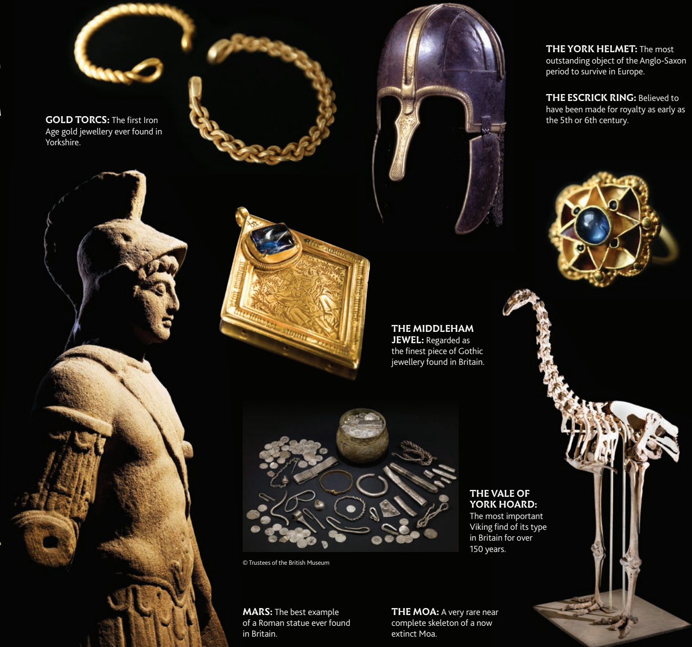
GOLD TORCS: The first Iron Age gold jewellery ever found in Yorkshire.