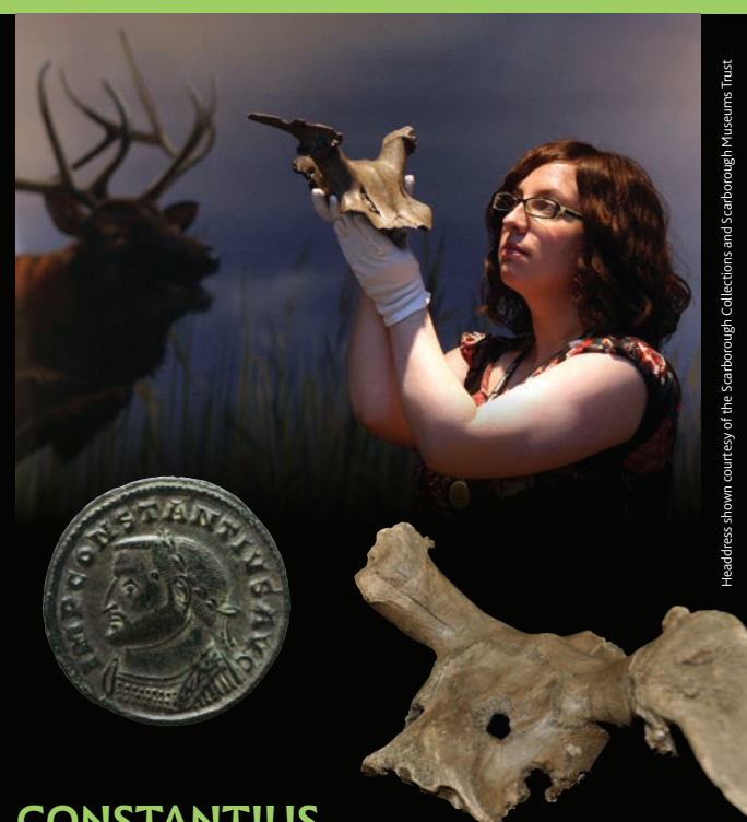
Headress shown courtesy of the Scarborough Collections and Scarborough Museums Trust