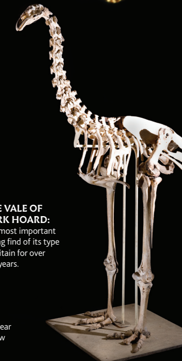
THE MOA: A very rare near complete skeleton of a now extinct Moa.