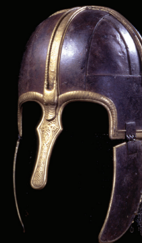
THE YORK HELMET: The most outstanding object of the Anglo-Saxon period to survive in Europe.