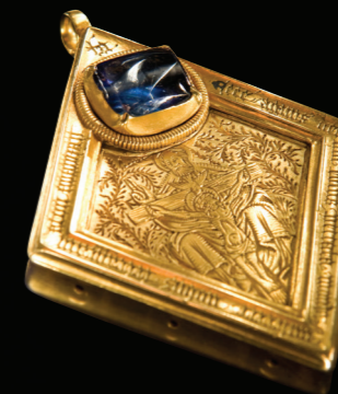
THE MIDDLEHAM JEWEL: Regarded as the finest piece of Gothic jewellery found in Britain.