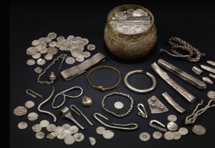
THE VALE OF YORK HOARD: The most important Viking find of its type in Britain for over 150 years.