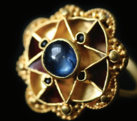
THE ESCRICK RING: Believed to have been made for royalty as early as the 5th or 6th century.