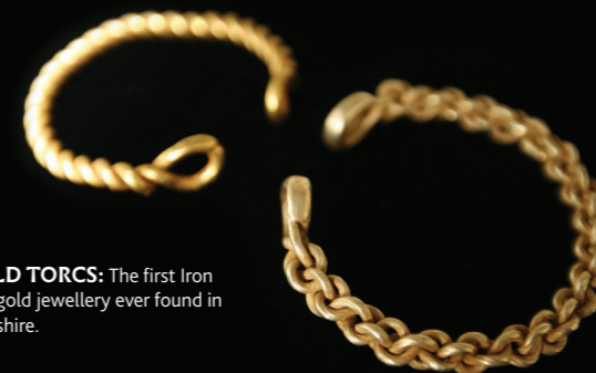
GOLD TORCS: The first Iron Age gold jewellery ever found in Yorkshire.