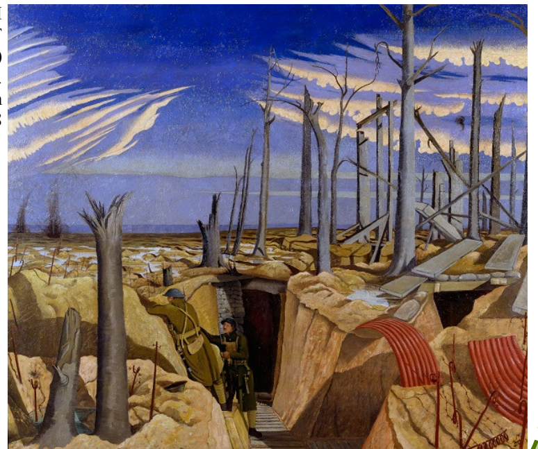
Oppy Wood, 1917. Evening, by John Nash 1918

Keep a look out for a Hands on Here! opportunity which will use the York Castle Museums military collection to help interpret the space further.