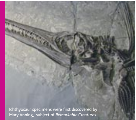
Ichthyosaur specimens were first discovered by Mary Anning, subject of Remarkable Creatures

To book a place ring York Museums Trust on 01904 650333